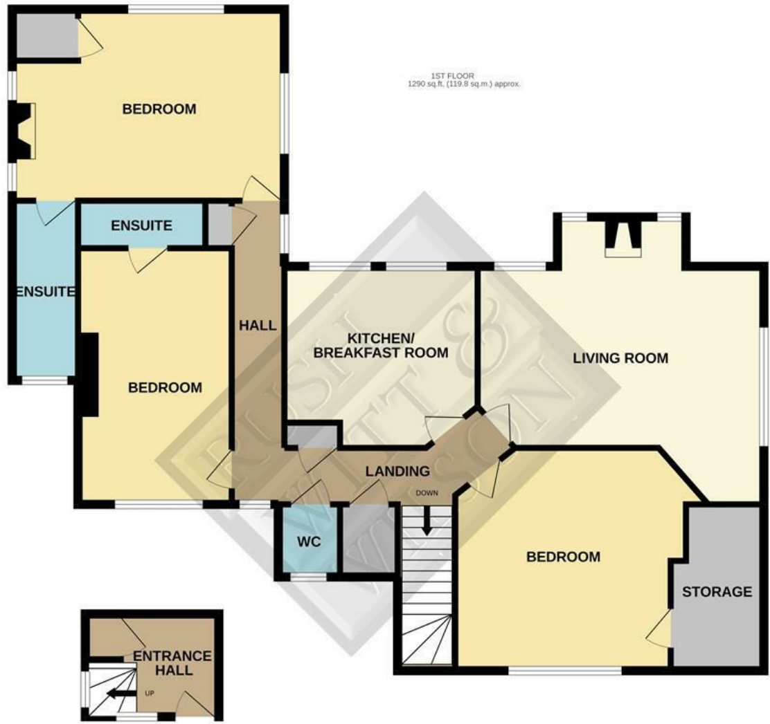
1ST FLOOR 1290 sq.ft. (119.8 sq.m.) approx.